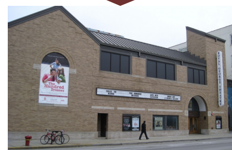
PHOTO Royal George Theatre in Chicago

FOREVER PLAID is the longest running show in Chicago history! It ran for 6 years at the Royal George Theatre!